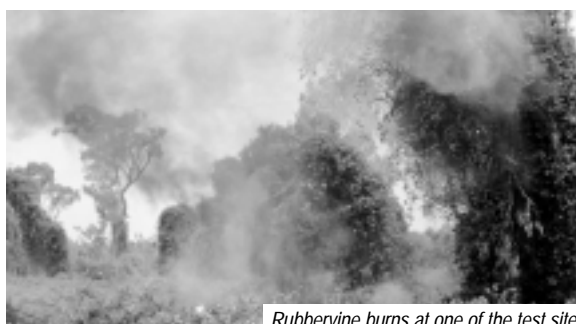
Rubbervine burns at one of the test sites

The project's results will contribute to the National Rubbervine Strategy, which is part of the National Weed Strategy.