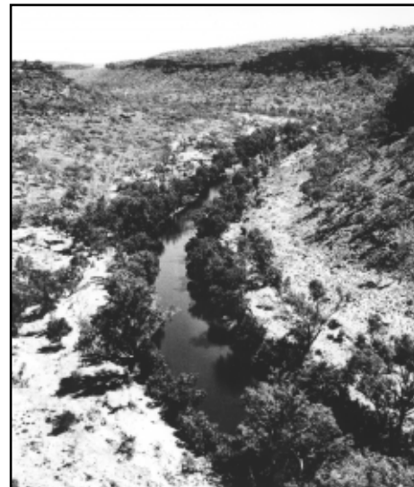
Figure 3: Left, view west along Jasper Gorge, 1950. Right photo taken in September 1998. Jasper Gorge is sandstone country and it is difficult to detect any major change in the original photo and the repeat.