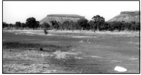
Figure 1 Above: Conellan's mail plane at Coolibah Station with Wondoan Hill in the background, 1959-60. Same location below, picture taken in 1996. In this case most of the scatter of trees on the far side of the airstrip in the repeat shot are probably growing along the banks of a shallow billabong which circles around the north side of the homestead.