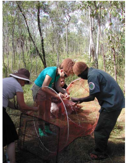
Action with the Cadell turtle trap

Another successful and enjoyable field trip has been completed. WLM404 Natural Resources and Livelihoods completed a successful intensive during semester break. MTEM students were joined by Desert Knowledge CRC participants and travelled to Maningrida in central Arnhem Land eager to learn more about the role of natural resources and indigenous livelihoods. The intensive provided students with a unique opportunity to experience the myriad of issues facing remote Aboriginal communities in northern Australia.