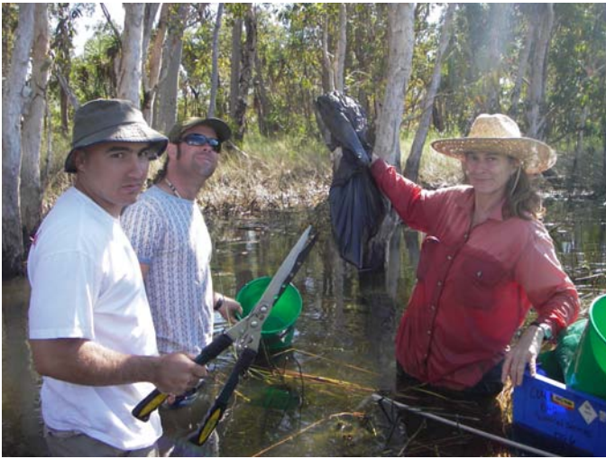
Humph. We thought as much.